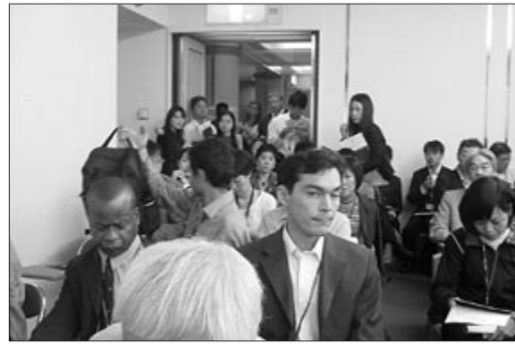
Overflowing audience at the launching event

Toyama as a COP10 partnership event co-organized by NPEC and Toyama prefecture; 2) CBD Technical Series Report Launching Event held on Oct.19 as a COP10 side event co-organized by CBD Secretariat and United Nations University-Institute of Advanced Study (UNU-IAS); 3) Side Event on Sato-Umi; A Synergy of Tradition and Science for Biodiversity along Japanese Coast held on Oct.21 organized by Ministry of the Environment (MOE), Japan; and 4) Informal Consultation Meeting on the Sustainable Ocean Initiative (SOI) held on Oct.24 co-organized by CBD Secretariat and UNU-IAS.