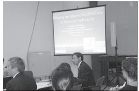
at the event of UNEP which held in Nagoya as a side event of COP10.

activities and situation in regional scale and the role of UNEP for the marine biodiversity conservation in global scale were exchanged. The panelists agreed that UNEP and Regional Sea Programmes are key framework for sharing information on activities implemented in each local site and confirmed the necessity on the contribution of local activities to regional and global marine biodiversity conservation. The outputs of this forum were introduced