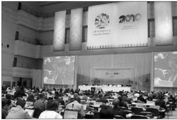
COP10 at Nagoya Congress Center