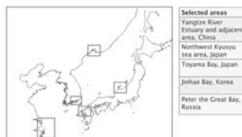
Figure 1. Selected sea area for eutrophication assessment

assessments have been conducted in these areas since the beginning of this year.